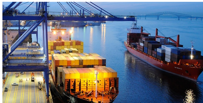
Port of Baltimore.

As a component of the overall Maryland Transportation Initiative described above, the Maryland Port Administration (MPA) released the report, “Climate Change Vulnerability Assessment and Recommendations (2010). 63 ” The report includes recommendations for future programming of capital investments based on the findings of the vulnerability assessment. Facilities and systems under its management, as well as facilities being considered for development or redevelopment as part of MPA’s Marine Terminal Development Plan and Dredged Material Management Program are addressed.