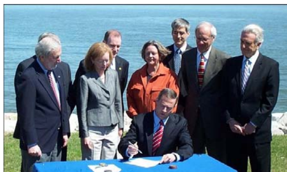
Maryland Governor, Martin O'Malley, signs an executive order on April 20, 2007 establishing the MCCC.

Within the past three years Governors or state legislatures in nearly all the Mid-Atlantic states have convened high level councils to produce plans for responding to climate change. Some have completed their work, some are still midstream, and the initiatives vary in the degree to which adaptation (as opposed to mitigation) is a focus. One municipal effort, that of New York City, is profiled among these efforts because New York City contains such a significant proportion of New York State's coastal population and infrastructure.