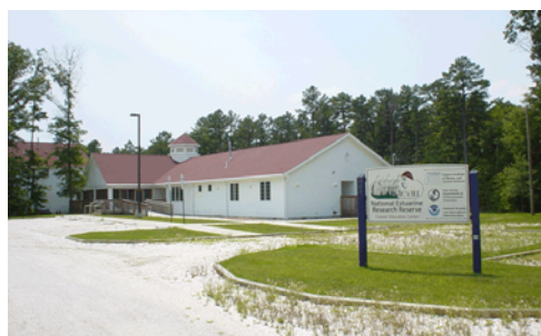
Jacques Cousteau National Estuarine Research Reserve (JCNERR).

Maryland and Virginia each have a Chesapeake Bay National Estuarine Research Reserve. Both are engaged in activities to enhance public awareness, train coastal managers, and build capacity related to climate change adaptation. Both reserves – one operated by the Maryland Department of Natural Resources, the other by the Virginia Institute for Marine Studies – have offered training sessions such as “How Prepared Are You For Rising Waters? Planning for Sea Level Rise” and implementation of each state’s Living Shorelines policies. 57