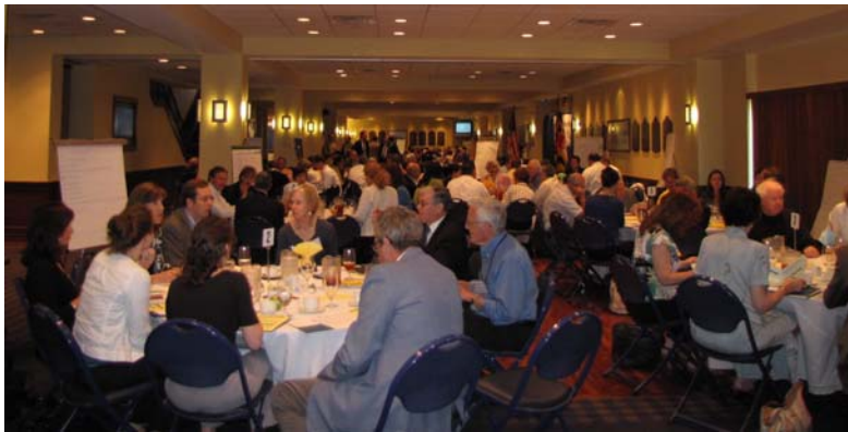
Participants at the Building CoastSmart Communities Interactive Summit worked through a role-play exercise to learn about sea level rise adaptation.

MDNR developed the CoastSmart Communities Initiative to support local level implementation of the Adaptation Strategy. 24 Under the initiative local governments can access an online resource center with a comprehensive toolbox of resources to become ready, adaptive, and resilient to the impacts of sea level rise and coastal storms. MDNR launched the program with a 2009 CoastSmart Communities summit whose centerpiece was a role-play exercise. Ongoing activities, detailed below, include promoting additional role play exercises, grants, technical