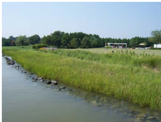
An example of a low sill living shoreline project in Maryland.

In 2008 the Maryland legislature enacted a law similar to a Virginia law requiring riparian property owners to rely upon "living shorelines" – nonstructural shoreline stabilization measures such as marsh creation – whenever feasible to protect shorelines from erosion while also providing critical wildlife habitat. 36 A variety of public agencies are involved in implementing the program and related efforts. The Maryland Department of the Environment (MDE) is charged with developing implementing regulations in cooperation with MDNR. In June 2009 the Maryland Department of the Environment issued draft regulations for a process to waive the requirement where nonstructural measures are not feasible, and to map areas designating locations where traditional structural solutions are required. 37 MDNR's