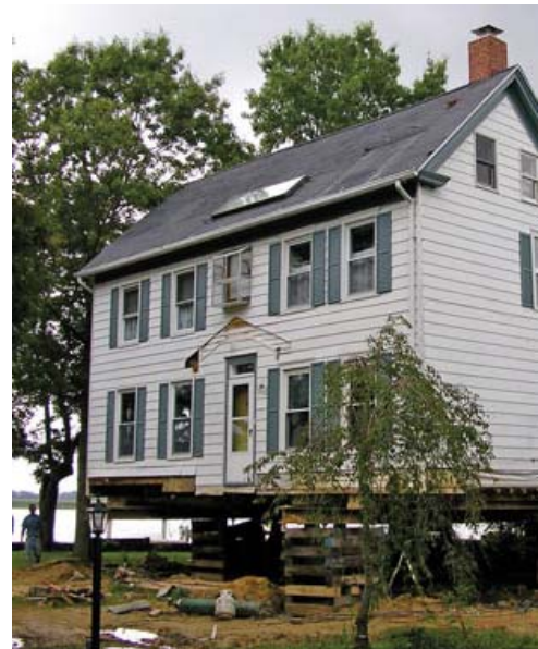
Storm damaged house being raised above base flood elevation.

Severe statewide flooding in 2004 led New Jersey to update its Flood Hazard Area Control Act rules and related amendments to the state’s Coastal Permit Program rules and Coastal Zone Management rules. The rules adopted by the New Jersey Department of Environmental Protection in 2007 set more stringent standards for development in flood hazard areas and riparian zones adjacent to surface waters throughout the state. The changes include new flood hazard area and riparian zone standards applied to the review of all CAFRA (Coastal Area Facility Review Act) and Waterfront Development permits. These changes include a requirement that the lowest finished floor of a new building must be at least one foot above base flood elevation. Other new standards include a requirement for 0% net infill in all non-tidal flood hazard areas of the state to protect hydrological functions, and expanded riparian buffers to protect aquatic life. 43