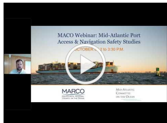
Mid Atlantic Port Access and Navigation Safety Studies Webinar 10 8 20