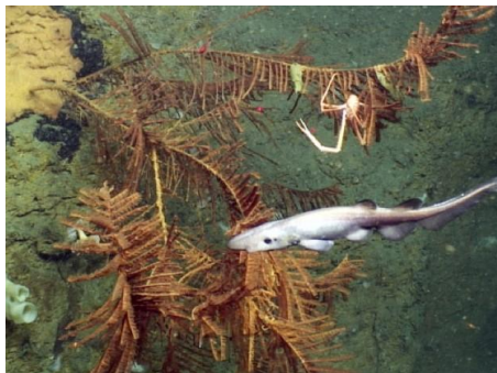
Life in the Deep Sea Canyons

Throughout the fall, MARCO has been partnering with top scientists to explore the deep sea canyons through a webinar series, "Life in the Deep Sea." Millions of people live along the Atlantic coast and spend time recreating on our beaches and shores. Yet few people know that far offshore and deep underwater lie some of the most majestic and remarkable features in our ocean. Deep sea canyons run along the underwater coast of the Mid-Atlantic at various points along the shelf break and provide vital habitat to ancient corals and other unique species who would otherwise have difficulty thriving in the harsh, cold, dark environment. Studying these fragile habitats and the hidden and unusual species that live in them is important to understanding how our decisions and daily behavior can impact