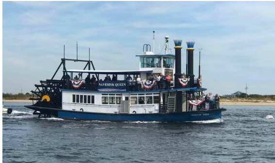
Navesink Queen scrolling data maps.)